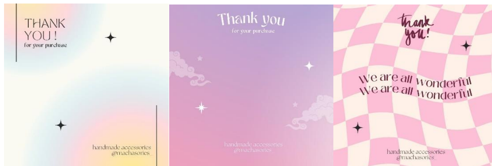
Figure 3. Packaging Accessories

If we calculate from the assessment given, the quality of the accessory product reaches 86.6%. In other words, it can be seen that for the younger generation, bead accessories are very interesting and worthy of being a business. After knowing the quality of a product, digital business literacy requires something that becomes a supporting point for a business, namely packaging. Regarding this, machasories created 3 attractive and contemporary packaging versions, as in the following image.