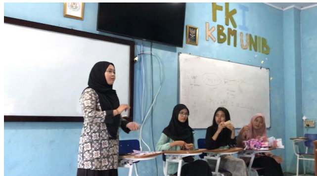
Figure 1. Exposure related to Machasories

This study will look at how machasories businesses can be an effort to increase digital business literacy in generation z. The respondents in this study were 47 people who were divided into 9 groups aged 19-22 years. The first thing to do is to provide a presentation regarding the machinations business.