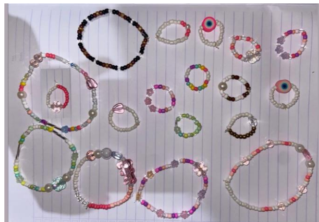
Figure 2. Machasories Products

In the presentation, it was stated that the maschasories business is a business that sells various contemporary aesthetic accessories which are currently a trend among young people. Accessories sold include necklaces, rings, bracelets, scrunchies and many more. The main ingredients in making this accessory are clear elastic rope, various kinds of beads in various shapes. When making bracelets, there are various themes, for example the pink theme