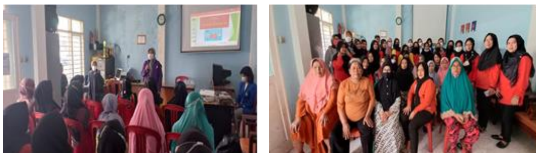
Figure 2. Providing health counseling on family planning to WUS and Attendees

The diagram above shows that 54.9% had participated in the family planning program, while 45.1% did not use the family planning program. Families who follow the family planning program because they want to have a few children, do not want to bother and the economy if many children must have many needs, while the reasons for families who do not want to follow the family planning program are because they do not know, do not understand the benefits of family planning, are not allowed by their husbands, and are afraid of the side effects of family planning.