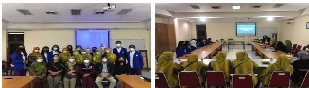
Figure 3. Delivering the results of community service to the Carigin Health Center of Bandung City