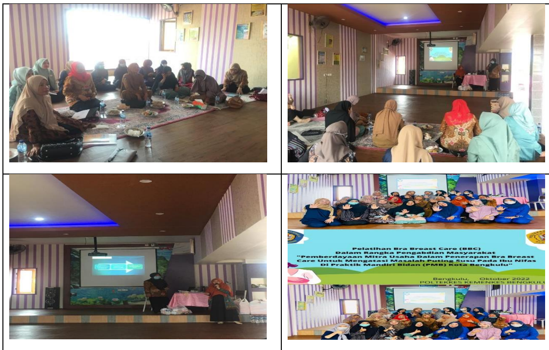
Figure 3. BBC making training at PMB Susi Irma Nova, SST which was attended by 25 alumni and 4 community service team members