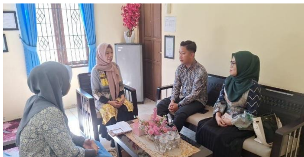
Figure 2. Coordination with the Liang Anggang Agricultural Extension Center

Coordination was carried out with the Liang Anggang Agricultural Extension Center for the schedule for the implementation of community service and coordination of the material to be delivered and the methods used in the activity. Counseling material is a discussion related to the benefits of ginger from the health field and in treating digestive problems, warming the body and can be used to increase the body's immunity (Yunarti & Majid, 2024). Ginger contains active compounds such as phenolics and shogaol which are useful as antioxidants and promote heart health (Sari & Nasuha, 2021). The content of compounds in ginger is the reason why ginger is used as a medicinal plant. Improper use of traditional medicine can be harmful to health. The dosage and measurement used in taking traditional medicine need to be considered to minimize the side effects caused (Sumayyah & Salsabila, 2017).