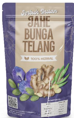
Figure 3. Product of Instant Ginger and Butterfly Pea Flower Powder

Coordination was carried out with the Liang Anggang Agricultural Extension Center for the schedule for the implementation of community service and coordination of the material to be delivered and the methods used in the activity. Counseling material is a discussion related to the benefits of ginger from the health field and in treating digestive problems, warming the body and can be used to increase the body's immunity (Yunarti & Majid, 2024). Ginger contains active compounds such as phenolics and shogaol which are useful as antioxidants and promote heart health (Sari & Nasuha, 2021). The content of compounds in ginger is the reason why ginger is used as a medicinal plant. Improper use of traditional medicine can be harmful to health. The dosage and measurement used in taking traditional medicine need to be considered to minimize the side effects caused (Sumayyah & Salsabila, 2017).